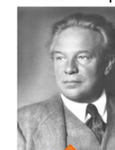
Ottorino Respighi On the Via Appia