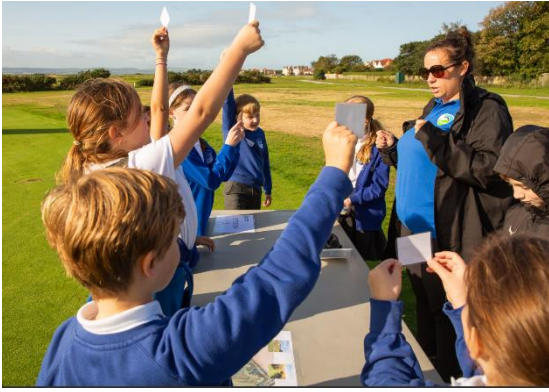
Learning about wildlife