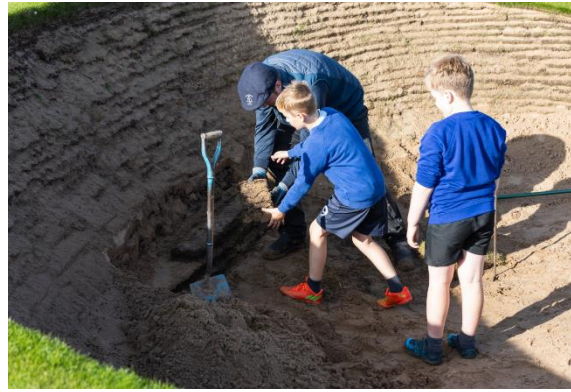
Building a bunker