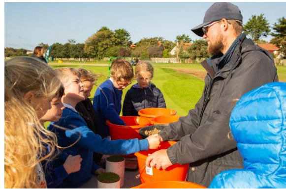
Learning about the seeds & grass